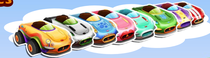
Drive them all!