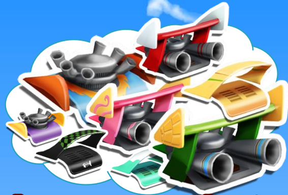
Improve your karts