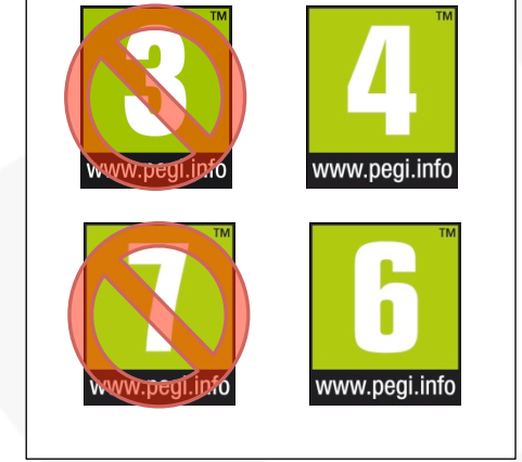
Instead of 3 use 4:

In order to comply with the current national laws in Portugal, PEGI age categories have to be modified. Labelling and advertising of interactive software in Portugal must take into account the following national specificities: